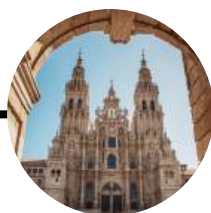
Santiago de Compostela